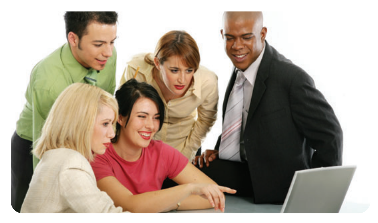
Find out how PAINS has helped thousands of clients all over the world. Visit us today at www.owlsinc.com and read more about it.

"I wanted to send a note of appreciation to the OWLS Staff for today's leadership course for our Microsoft Team. From today's experience, I am looking to bring my consulting team back to OWLS."